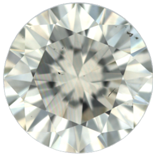
* Actual face up image, Not to scale Clarity grading scale